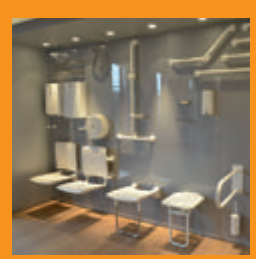
The Friville showroom

All the subsidiaries are progressively developing their own showrooms. They provide a venue to receive customers and specifiers locally, and to train the teams at each of the Group's subsidiaries. Following the showroom at DELABIE Benelux's premises in Brussels, a new showroom was recently inaugurated at the KUHFUSS-DELABIE offices in Dortmund, Germany, and another will soon be opened at DELABIE UK's headquarters in Wallingford.