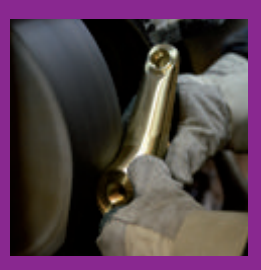
Polishing DELABIE's foundry in Braga, Portugal

Total control of the production process guarantees delivery times are kept to a minimum. DELABIE's clients do not wait!