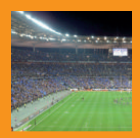
Stade de France Paris