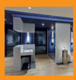
The Dortmund showroom

All the subsidiaries are progressively developing their own showrooms. They provide a venue to receive customers and specifiers locally, and to train the teams at each of the Group's subsidiaries. Following the showroom at DELABIE Benelux's premises in Brussels, a new showroom was recently inaugurated at the KUHFUSS-DELABIE offices in Dortmund, Germany, and another will soon be opened at DELABIE UK's headquarters in Wallingford.