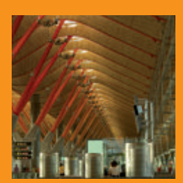
Barajas International Airport Madrid