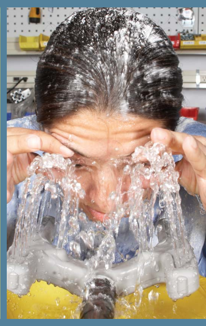
VISIT BRADLEYCORP.COM FOR INDUSTRY-LEADING BIM-REVIT/SYSQUE LIBRARY