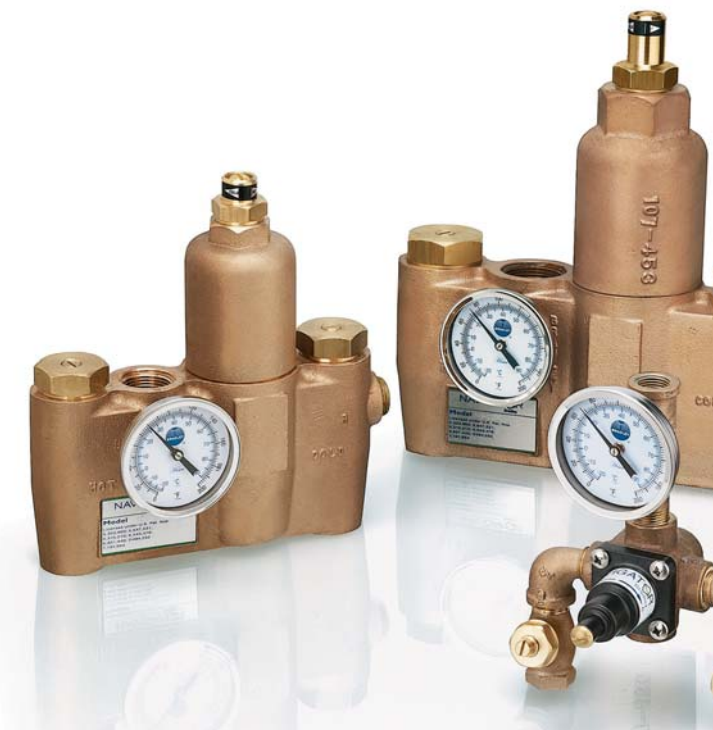
Emergency Thermostatic Mixing Valve Models